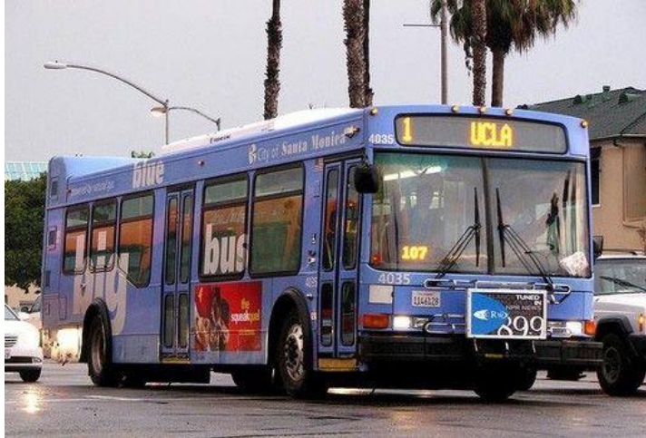
(UCLA Newsroom, 2016)